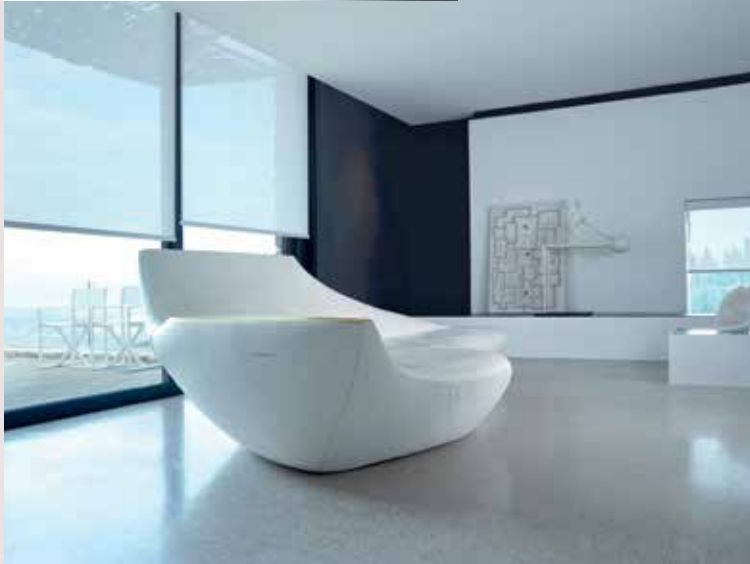
SCR-3005-01 CHALK - 200 / 250 / 300 CM