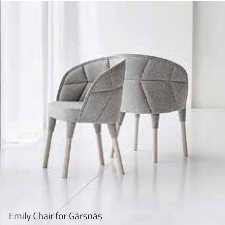
Emily Chair for Gärsnäs