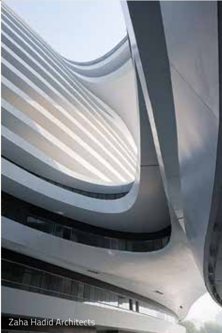
Zaha Hadid Architects