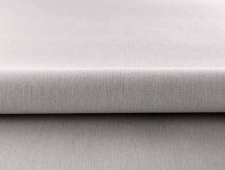
RF-MEXICO-5102 SAND - 280 CM