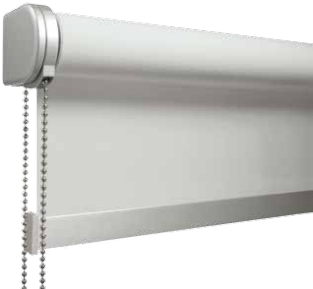
DESIGNER OPTION METAL BRACKET NATURAL ALUMINIUM

Surround yourself with light with the pure, bright fabrics in our collection. This super transparent jacquard has a subtle graphic print of clear organic shapes. It is decorative without being loud and ensures a very serene feeling. The organic shapes and white tones combine well with soft greys and pastels. The subtle metallic touches create a rich effect. Discover how hardware can enhance the total look of the blind with systems and accessories in matching colors.