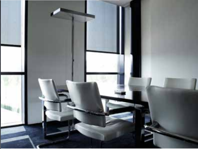
SCR-3005-06 EBONY - 200 / 250 / 300 CM