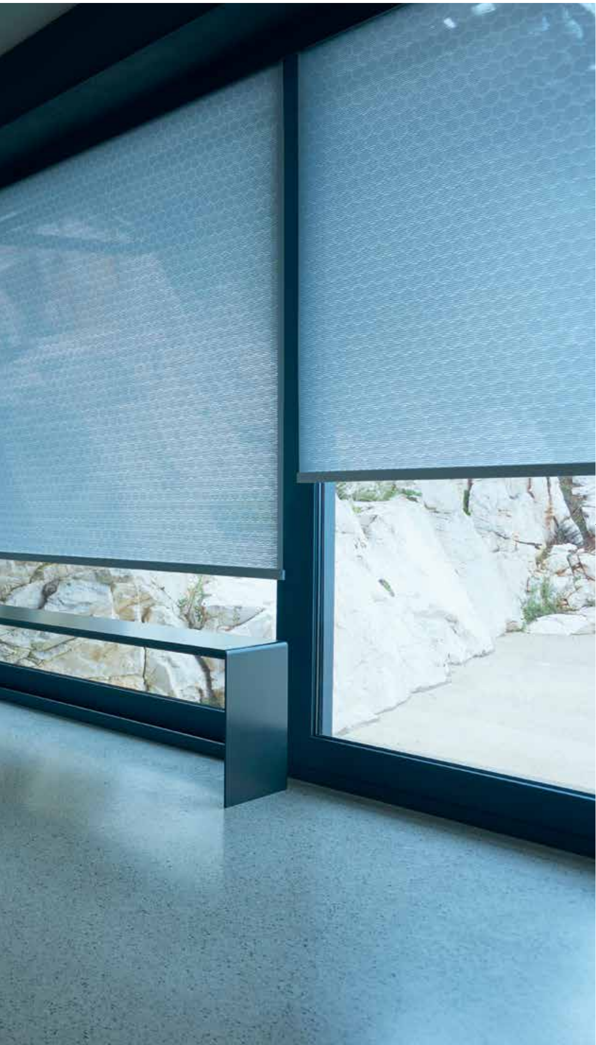
RF-JA21003-001 WHITE - 280 CM