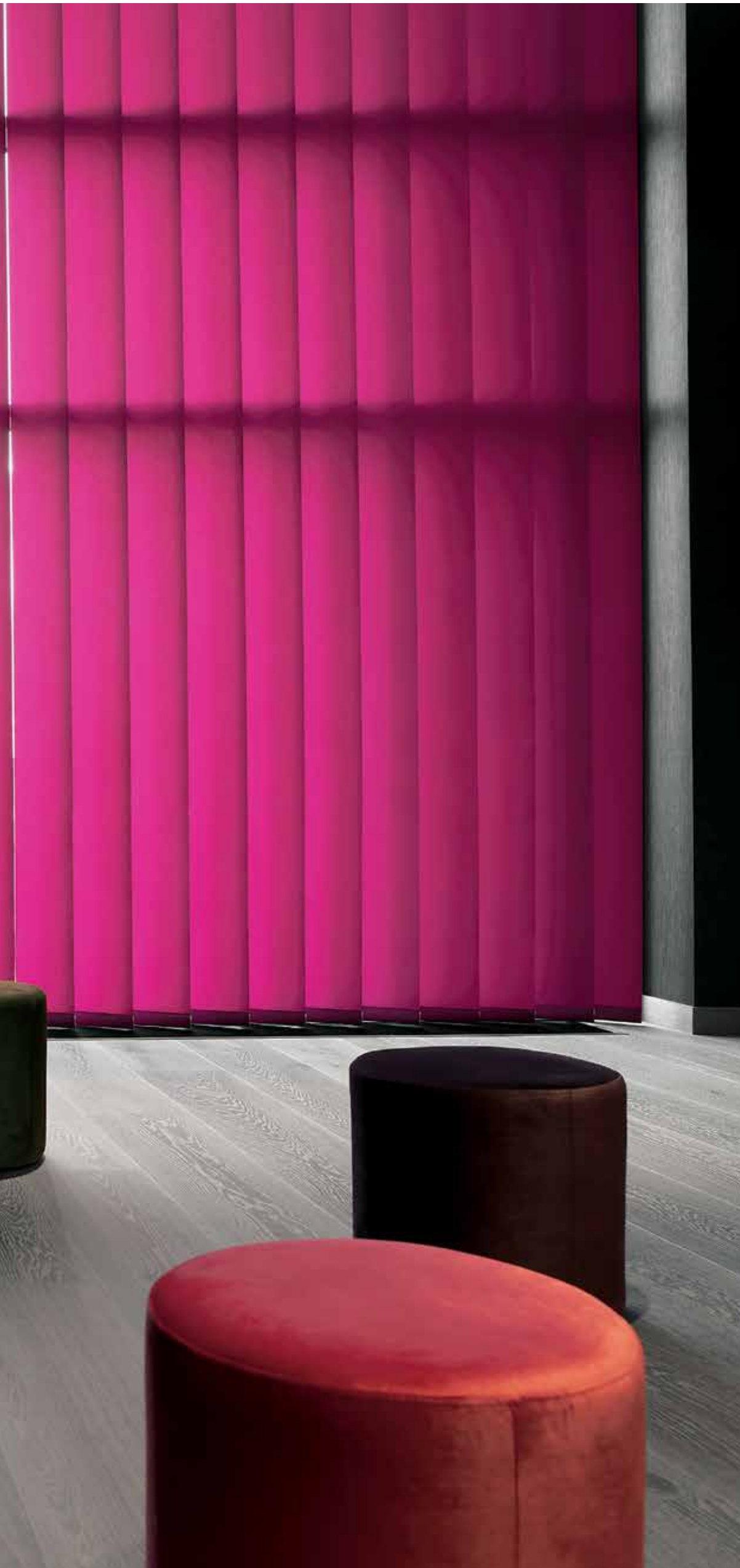
VF-BERLIN127-6410 PURPLE - 127 MM