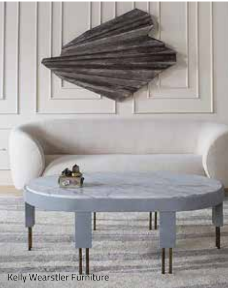
Kelly Wearstler Furniture