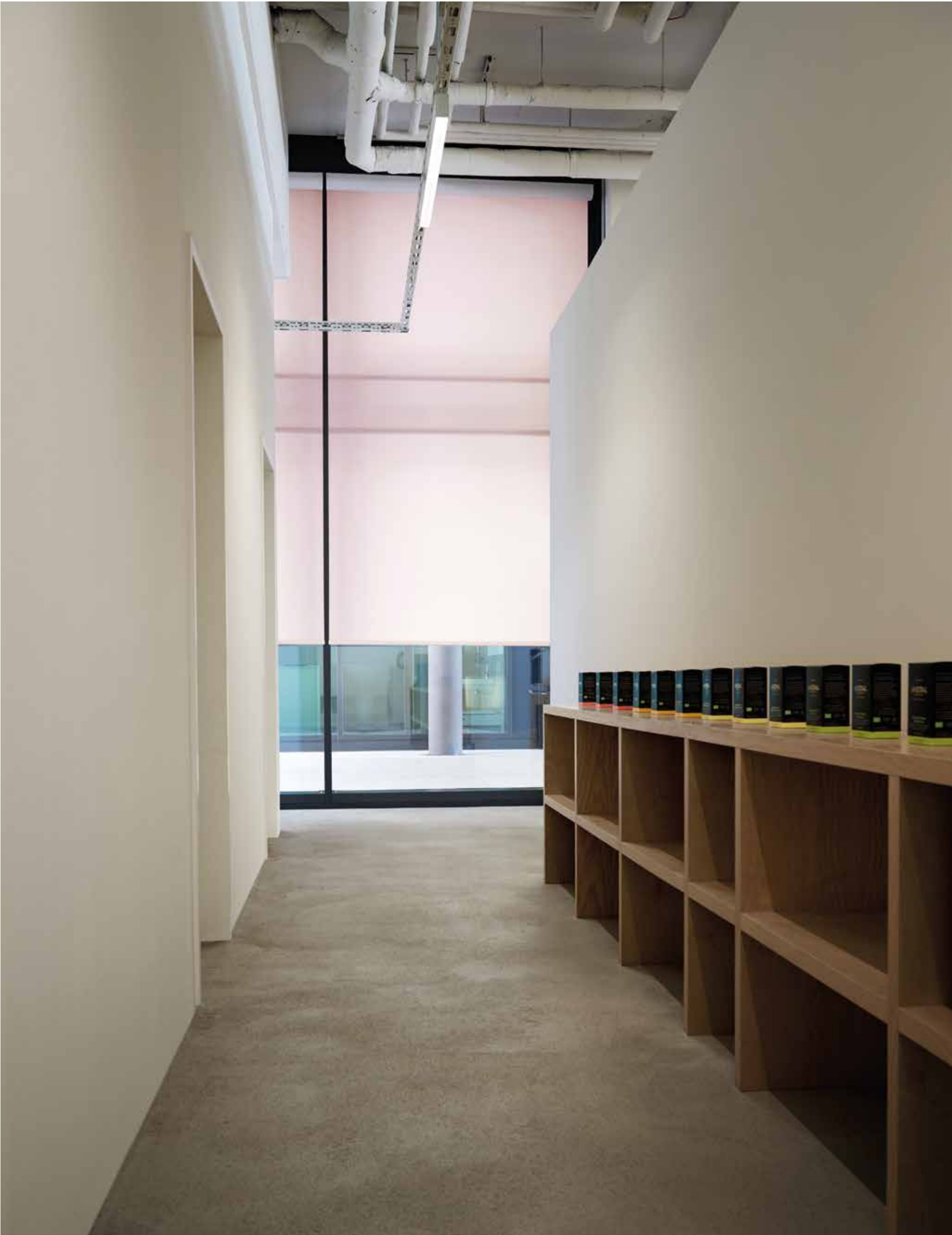
RF-DARWIN-0700 BLUSH - 280 CM