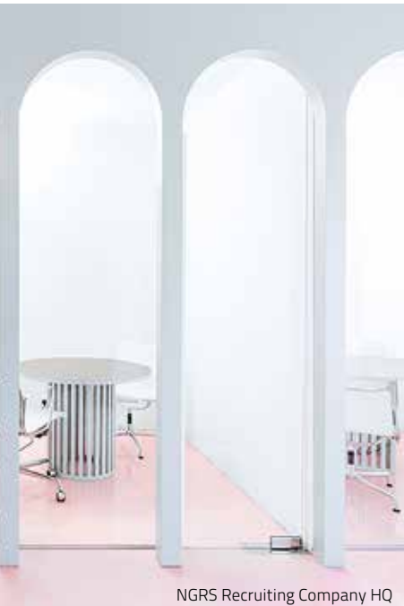
NGRS Recruiting Company HQ