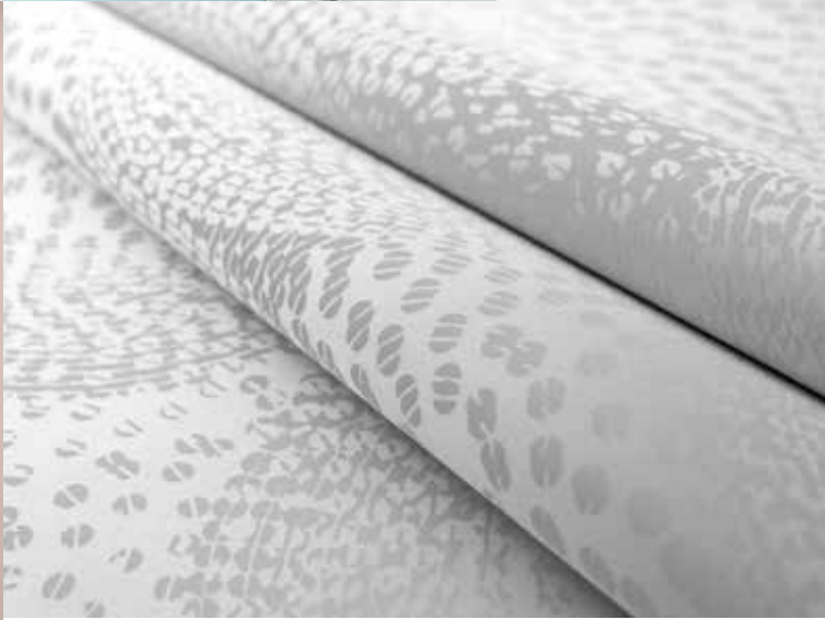
RF-SA14439-51 WHITE - 200 CM