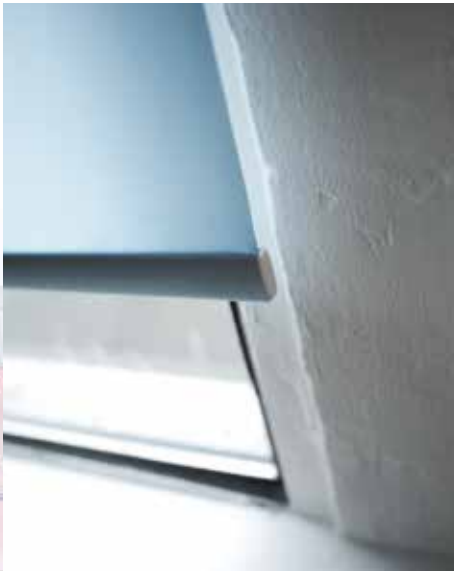
RF-BERLIN-0930 AIR BLUE - 200 CM