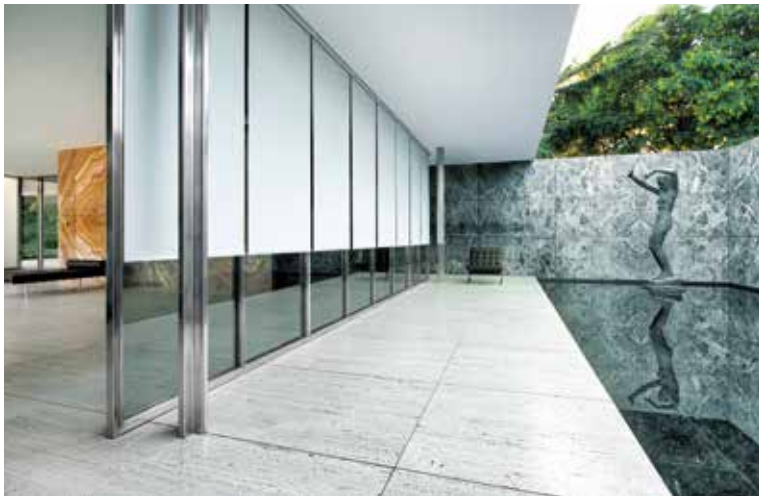
RF-MUN-FR-BO-5160 SHELL - 200 / 300 CM