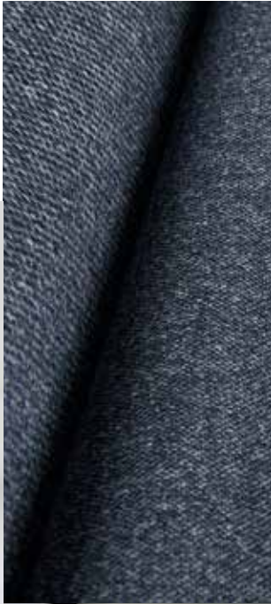
RF-WINCHESTER-0900 CASTLE ROCK - 300 CM