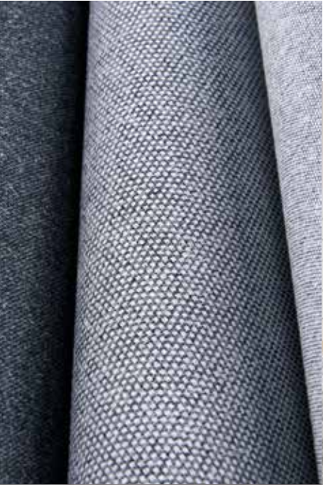
RF-RICHMOND-1000 FROST - 300 CM