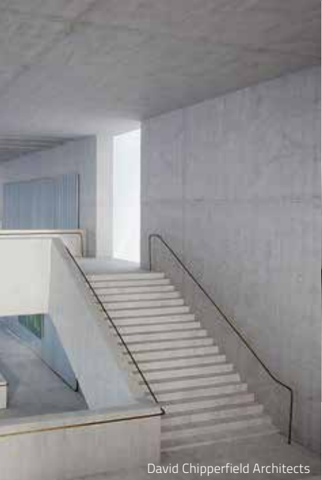
David Chipperfield Architects