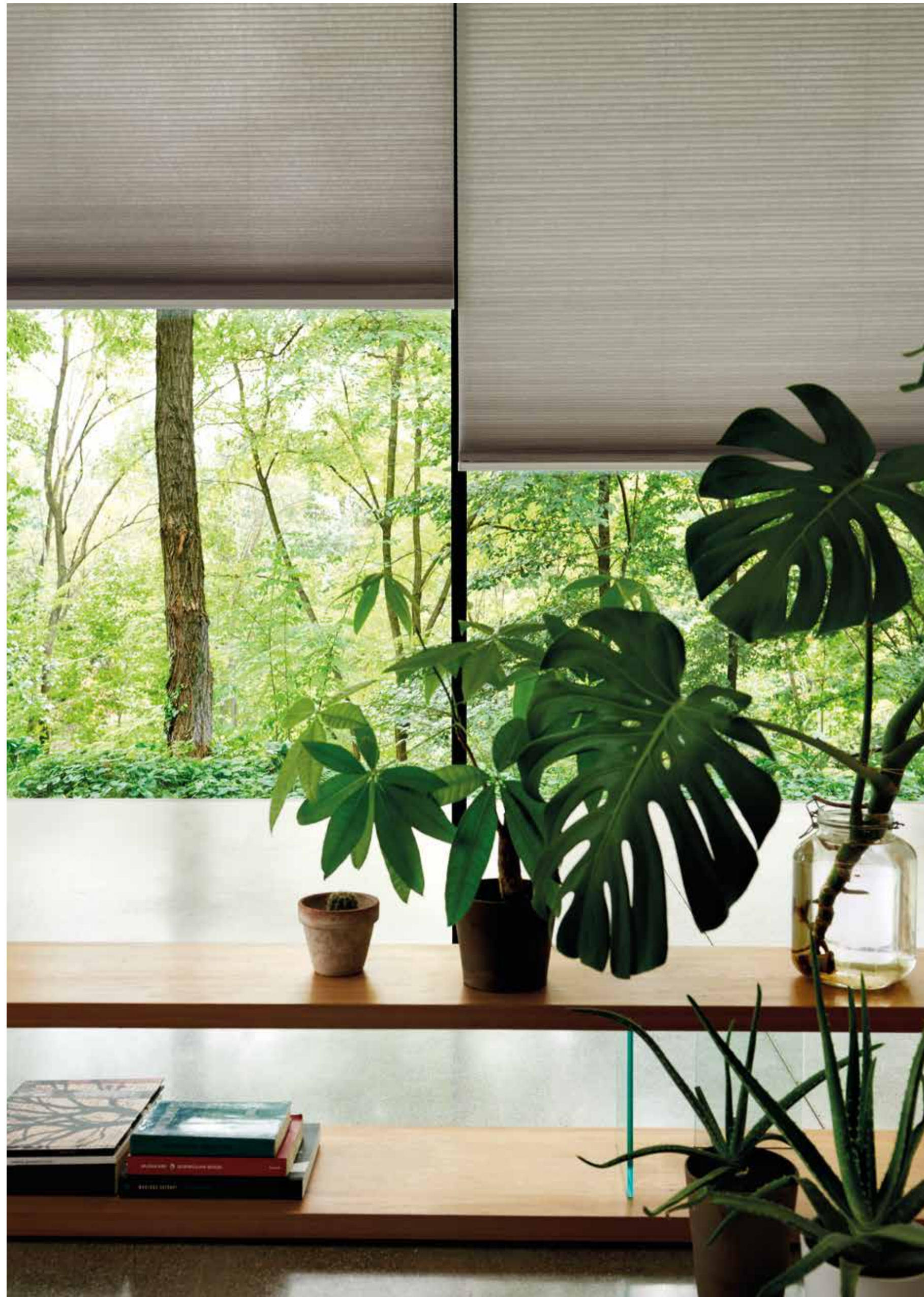
PF-HC25-PALMA 5170 - ASH