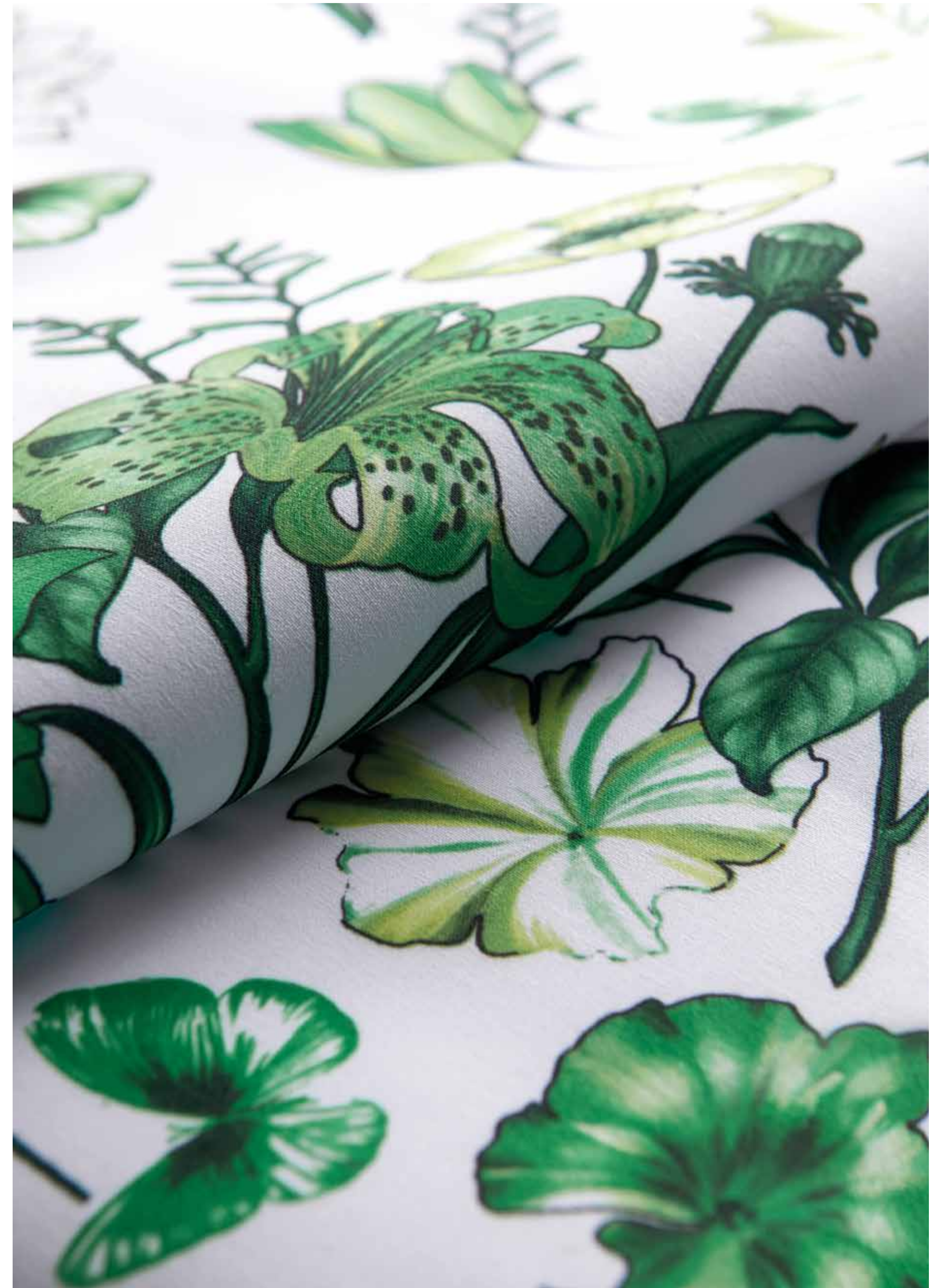
BOTANIC COLLECTION - RF-BOT150002-0200 - GREEN - 250 CM